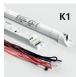
Emergency unit 1 hour