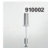
Suspension type "I" (x4)