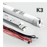
Emergency unit 3 hours