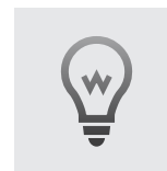
Lamps as optional