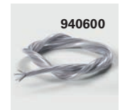
1,5 m transparent current cable 7x0,75 mm 2