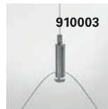
Suspension type "Y" (x2)